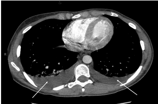
FIGURE 3. CT scan of chest with patient supine. Large, bilateral pleural effusions (arrows) developed because of extravasation of irrigation fluid into the thorax. The fluid is thought to have tracked along the retroperitoneal space into the peritoneum and finally into the thorax.

within the psoas muscle on the CT scan (Figs 1-3). We hypothesize that this patient has a communication between her retroperitoneal and peritoneal cavity that allowed for this amount of fluid extravasation. Essentially, her peritoneal cavity is not a closed compartment. Therefore, even with a low pump pressure, there was constant extravasation of pump fluid and difficulty maintaining our preset pump pressure.